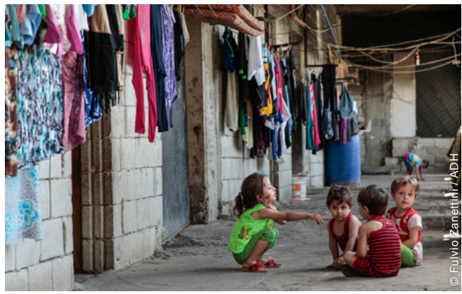
In Lebanon, the shelter strategy included minor repairs and rental assistance for those who could find buildings to live in, and water and sanitation upgrades, drainage and site improvements For families living in temporary shelters. Some of these were in urban areas (including Beirut, Mount Lebanon and Tripoli), while others in more rural or peri-urban ones (such as in the Bekaa). As the crisis continued, agencies began to make direct repairs of shelters (with negotiated lease agreements) in urban and rural areas.