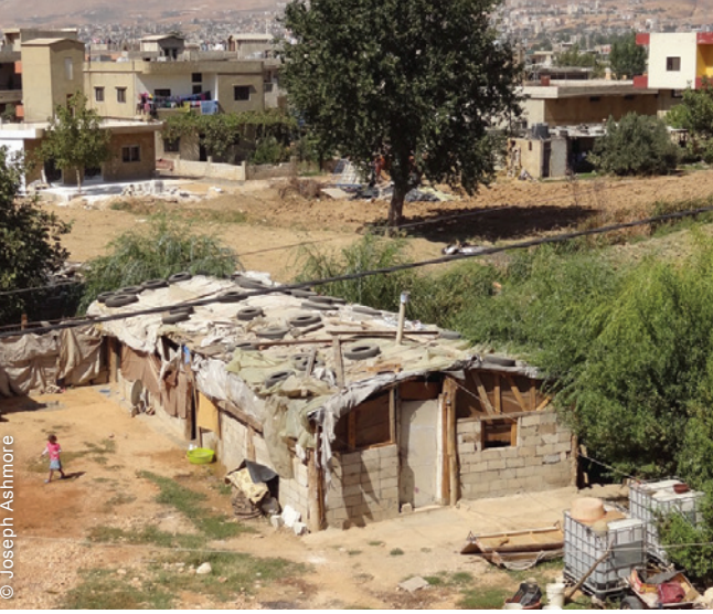
In Lebanon there was a no camp policy, and some families settled in temporary structures, often built with salvaged, improvised, materials.

In parallel, the Shelter Sector continued to make provisions for contingency planning and emergency response , through tents and kits. Additional areas of the response included strengthening awareness among affected communities of Housing, Land and Property rights through awareness sessions, and supporting ongoing capacity development to enhance governmental response to the IDP crisis<sup>16</sup>.