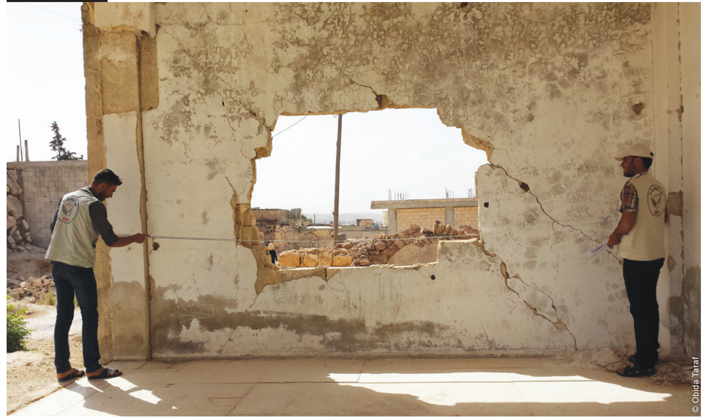
Given the very different operating environments, different responses took place in different countries. To promote some consistency, the Whole of Syria approach was adopted in 2013. In this picture we see assessment for a housing repair project within Syria.

MENA REGION A.29 / WHOLE OF SYRIA 2014-2016 / CONFLICT OVERVIEW