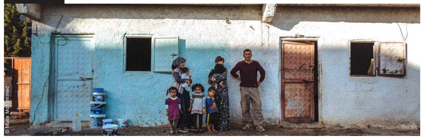
Syrian refugees in Turkey often seek shelter in unfinished and abandoned structures, as well as in shared accommodations. Humanitarian organizations started to implement winterization, repair, and cash-based interventions to support refugees in these situations.