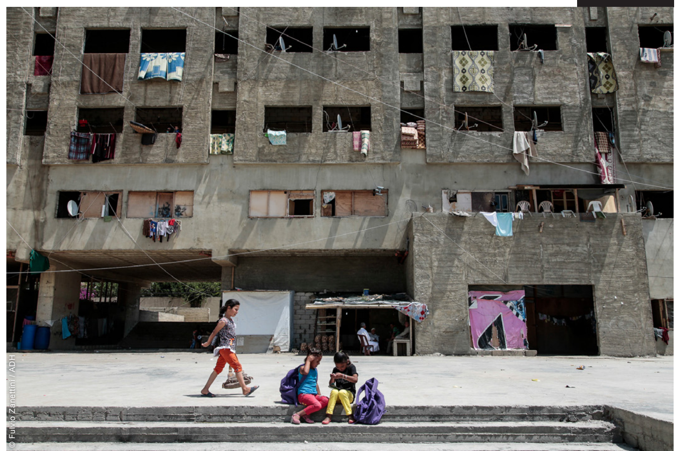
Syrian refugees in neighbouring countries live in a variety of accommodation types, often in urban areas, such as in this apartment block in Lebanon.