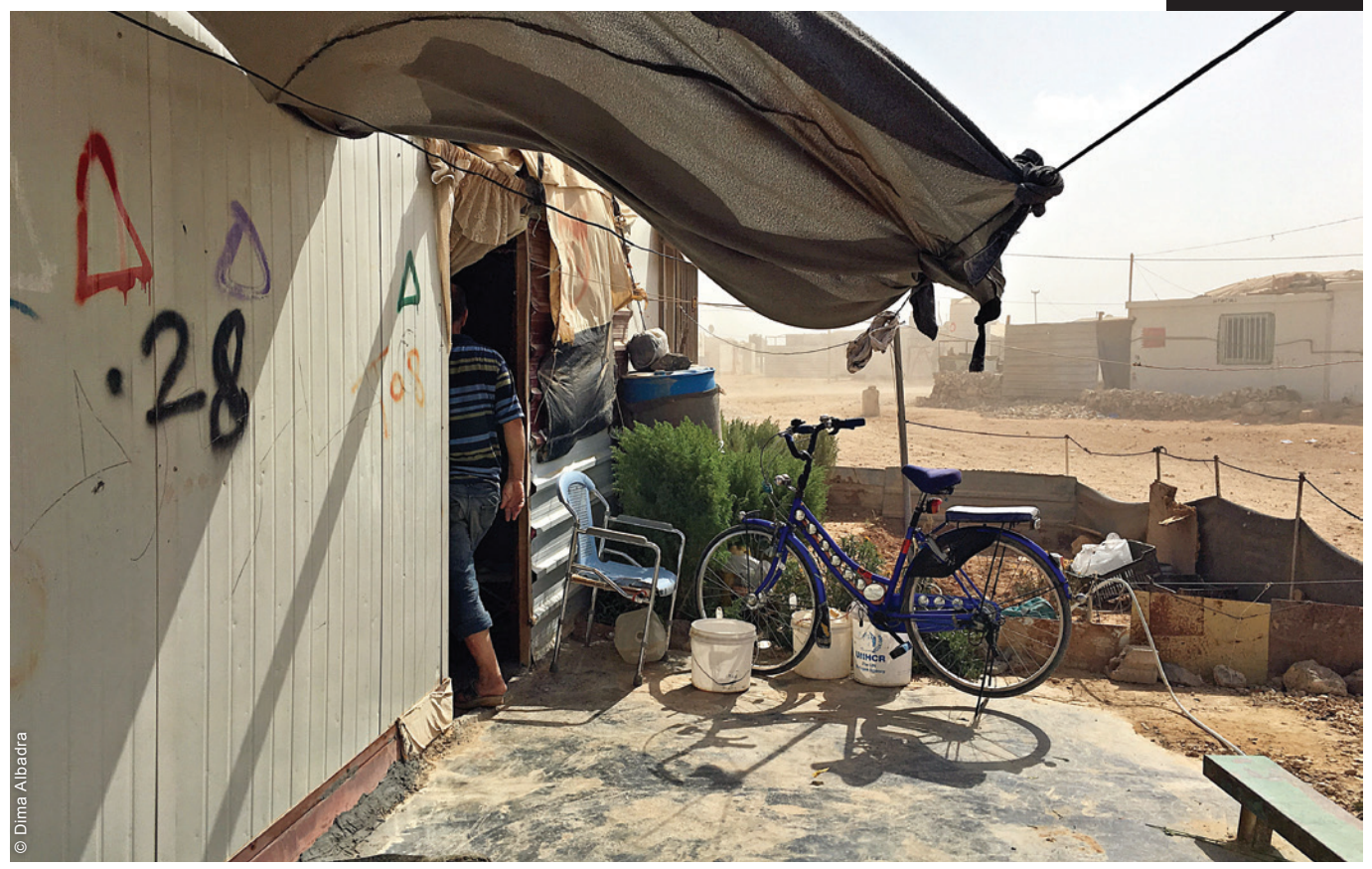
In Jordan, 83% of Syrian refugees were living outside of camp. However 120,000 people were sheltered in Azraq and Za'atari refugee camps.